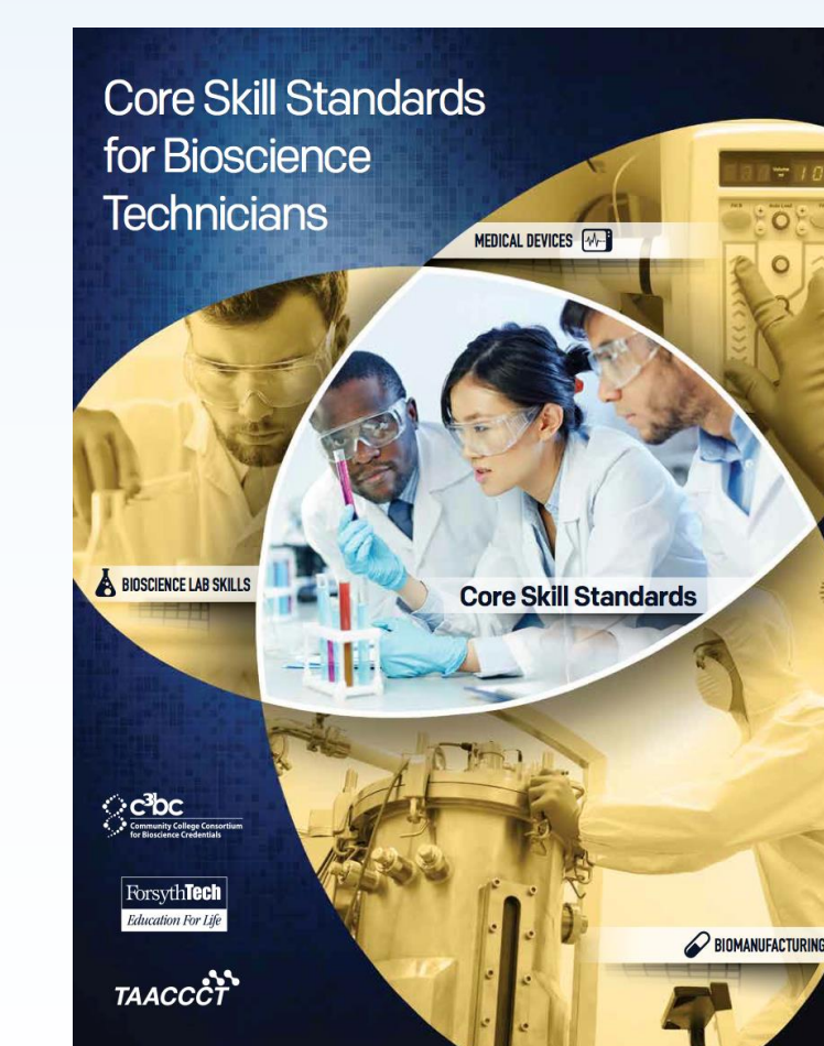
c3bc Core Bioscience Skill Standards