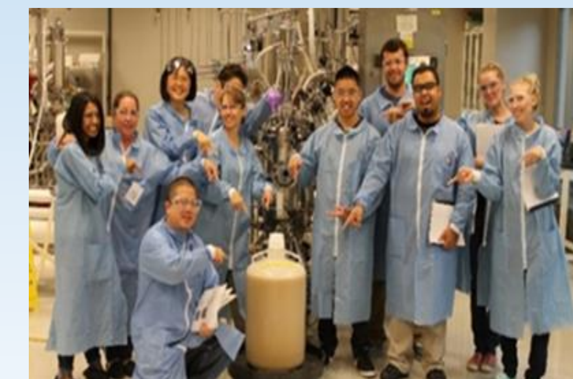
c3bc students at Capstone experience