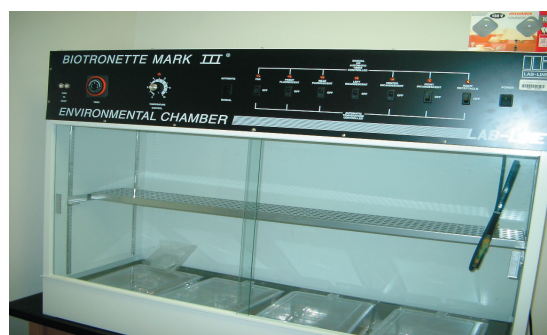
Figure 2. Environmental Chamber