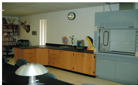
Figure 1. Cabinets & Fume Hood

With the provided grant funds, RCC was able to add a modern fume hood with associated cabinets and counter space to the biology laboratory (Fig.1), an environmental growth chamber (Fig. 2), and twelve stereo microscopes (Fig. 3). In addition, the grant supported faculty travel to several regional biotechnology meetings.