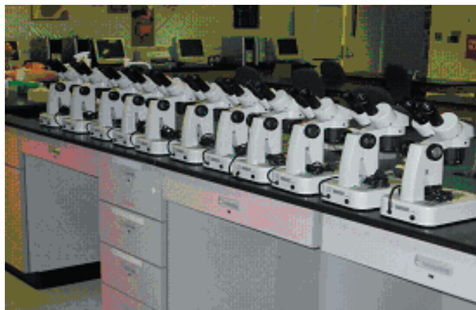
Figure 3. Stereo Microscopes