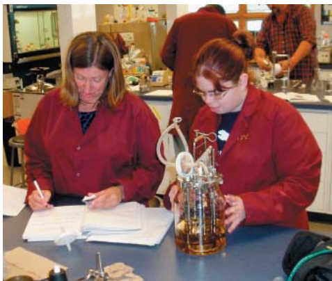
Bioprocess tech students focus on documentation skills

A curriculum for biotechnology technicians specializing in proteomics- a new field working to identify and understand the proteins cells produce in different situations - is being developed with Des Moines Area Community College and will be made available to post-secondary institutions nationwide.