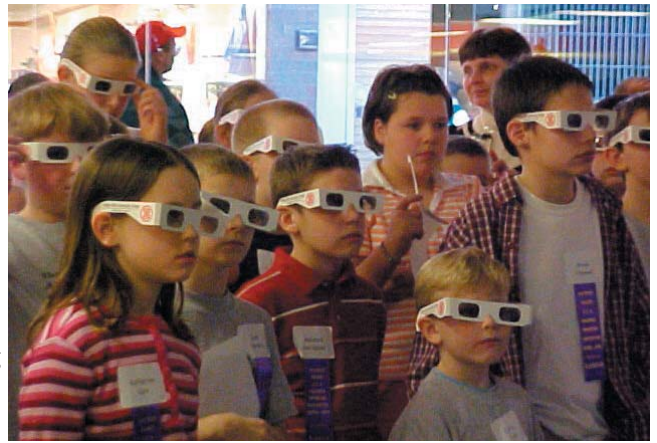
Young students enjoy the innovative 3-D virtual reality system to experience the process of fermentation

IHCC will develop relationships with four year colleges to address bio-based industry training needs. A plan to develop an apprenticeship program for students with local industries is in the works. A program to accurately identify useful, standardized skills for the creation of job models is also underway.