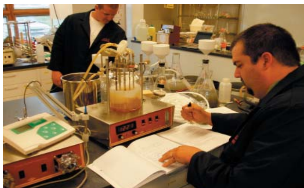
Hands on fermentation activity at the Iowa Bioprocess Training Center

Ethanol Plant Technician: program focuses on ethanol fermentation processes with instruction in electrical/electronics theory, process control, bioprocess lab techniques, digital fundamentals, and high level equipment maintenance and analysis.