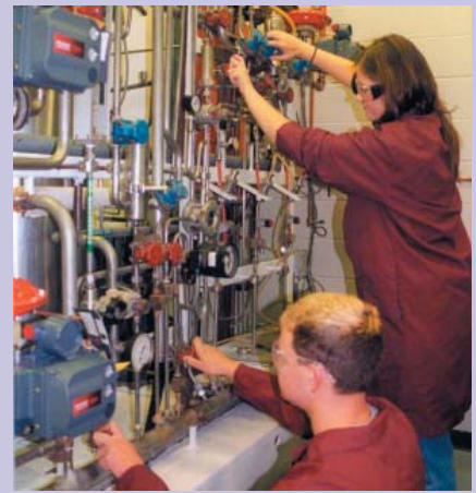
Pilot Plant Fementation Center

Trained workers are needed to capitalize on these emerging bio-opportunities. Designating Indian Hills Community College as a National Center strengthens the collaborative approach to growing the biotechnology industry as part of the state's economic base. IHCC, with support from industry and the DOL, has increased its training infrastructure and capacity with a pilot facility available for use by industry and entrepreneurs, and the development and offering of an ethanol plant technician program in 2005.